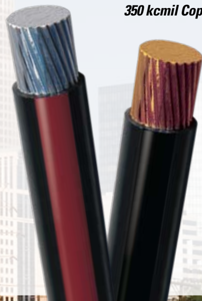
350 kcmil Copper