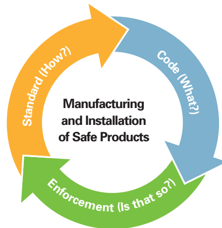
Relationship Between the Codes, Product Standards and Enforcements.

Ensuring safety for the entire industry is the ultimate goal of establishing and implementing code and product standards. Non-compliant electrical products, including those which misuse the UL mark, may have serious safety implications to the electrical industry. Contractors and distributors can help maintain safe products and installations by insisting that products manufactured in various parts of the world comply with North American codes and standards. As part of the cable selection process, contractors should require proof from the manufacturer that their product is UL listed before making the cable purchase.